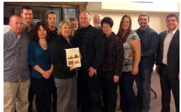
January 19th Recognition & Acknowledgement