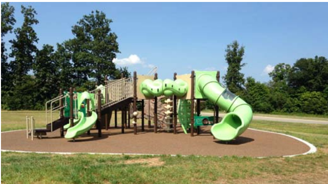
Walker Wood Park Playground

I just want to take a moment to reflect on 2014 and take a look at what is to come. 2014 was a busy year for Orange Township. Trails continue to connect the township, businesses continue to develop, and the township continues to find ways to communicate to the residents.