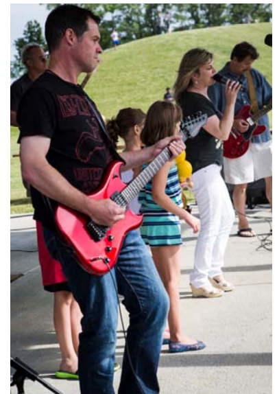
2014 Music in the Park

I have only mentioned a few items and there are many more exciting things going on in your township. If you would like to learn more, please follow us on Facebook, go out to our website at www.orangetwp.org , come to a scheduled trustee meeting, or just give us a call 740-548-5430.