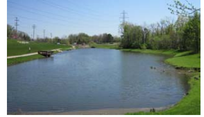
Township Hall Park Pond at S. Old State and Orange Roads